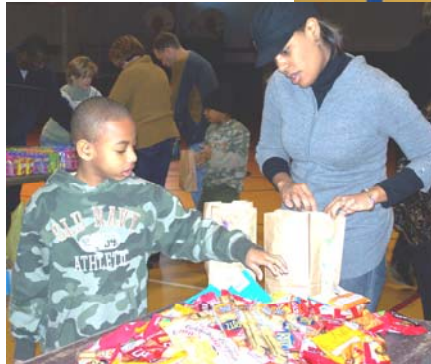
Volunteers pack snack bags for the Ronald McDonald House.